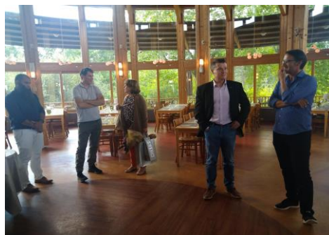
In a good mood at Department's tradi- tional summer lunch at Kupittaa Pavilion.