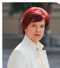
SOLVITA ĀBOLTIŅA Chairperson National Security Committee Latvia

With regard to cyber security, we must keep reminding ourselves that the best weapon against cyber threats is intelligence and critical minds that do not yield to provocation, deception and confusion. The only sustainable solution for the future is promoting critical thinking, improving analytical skills and raising media literacy. This is just as important as the continued efforts of the state to ensure its national security. We cannot depend on our allies and Article 5 alone; we need to be able to defend ourselves in cyberspace just the same as at our national borders. ■