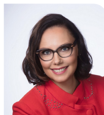
ANNE-MARI VIROLAINEN Minister for Foreign Trade and Development Finland

Sweden is the largest investor in Finland with a 45 percent share of the investment portfolio.