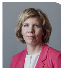
ANNA-MAJA HENRIKSSON Member of Parliament and Party Leader Svenska folkpartiet in Finland

We already cooperate through many organizations present in our region. Much can be done through the Nordic Council, and much can be achieved in the EU when we work together. We need to learn how to utilize the networks already in place to our benefit. There might be voices crying for us to look at our own countries first and ignore others – but I am convinced that we are far better off ignoring those voices and striving for yet more partnerships and close collaborations. I am willing to work for new ways of making the voices of our region louder. We have challenges when it comes to the environment and to our collective security. Our economies need working free trade without bureaucratic obstacles and harmful tariffs. These, among other things, we can best address together. I will work endlessly to achieve this moving forward. Please come along! ■