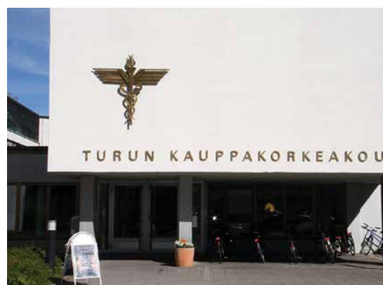
Turku School of Economics offers an excellent venue to organise an international conference.

Organisers of the conference want warmly to thank all the people organising and participating these events. You all made this a futures event to be remembered! ●