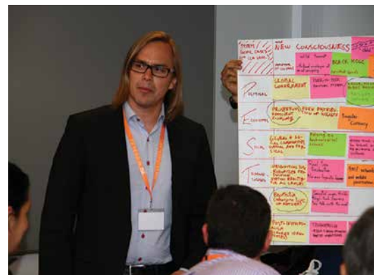
During the two days, altogether 260 participants from 33 different countries gathered to Turku.