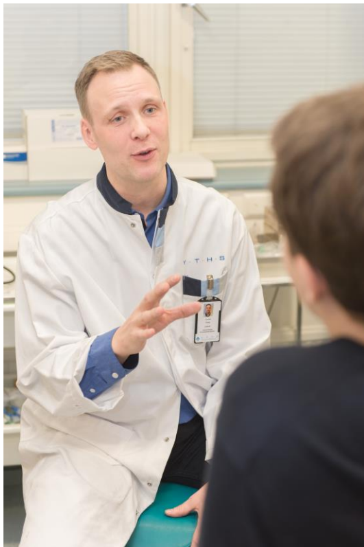
GENERAL HEALTH CARE