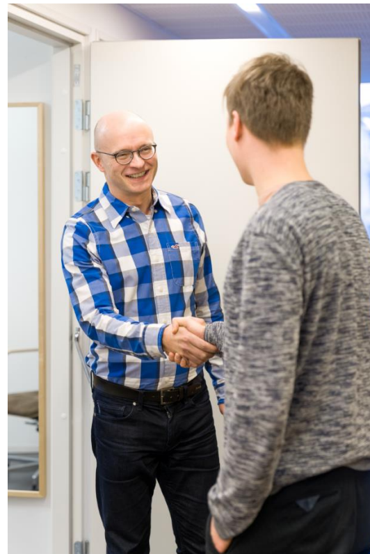
MENTAL HEALTH CARE