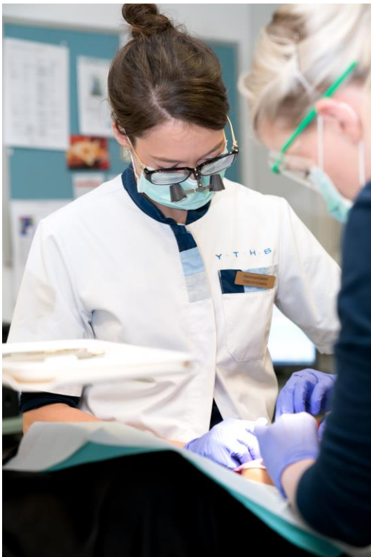
ORAL HEALTH CARE